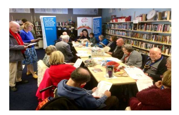
Parkinson's Café, Rhydypennau Hub