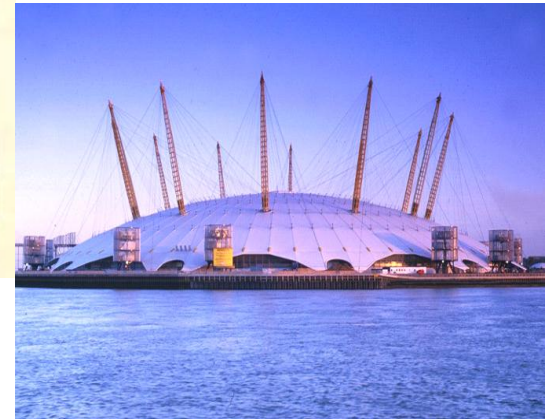
Value for Money